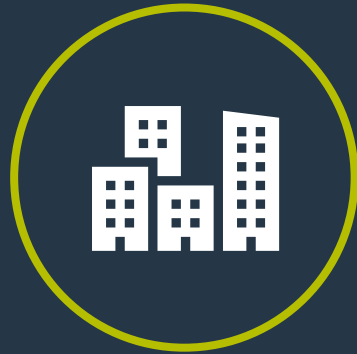
Real Estate Services